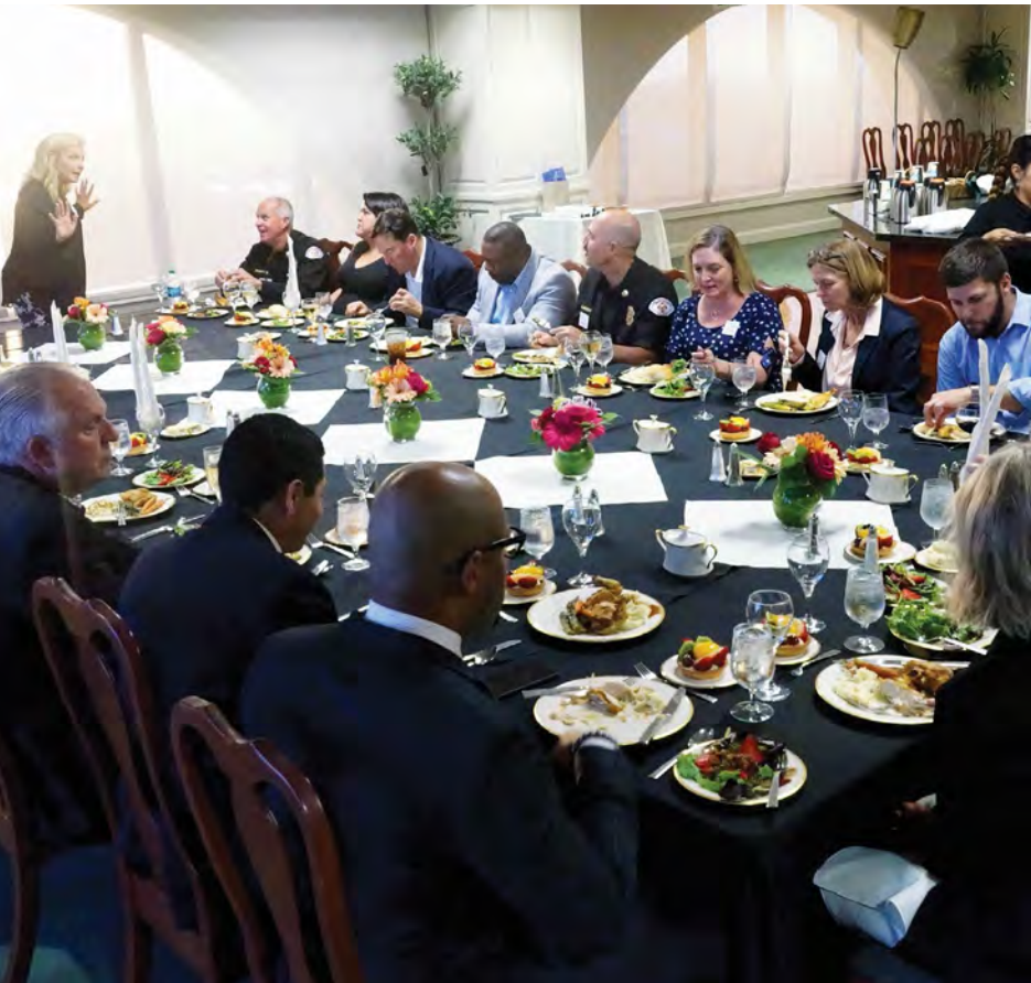
The Executive Leadership Series has a networking dinner after each session to enable participants to continue to bond with each other and interact with featured speakers and guests.

The program utilizes a small cohort size (between 15-20 participants) to maximize interactions and create greater learning opportunities. The ELS sessions are entrenched in Long Beach, using local resources such as CampFire - Angeles Council, Long Beach Playhouse and the Long Beach Conventions & Visitors Bureau. Sessions also include guest speakers, facilitators and leaders who are invested in making Long Beach better. ■