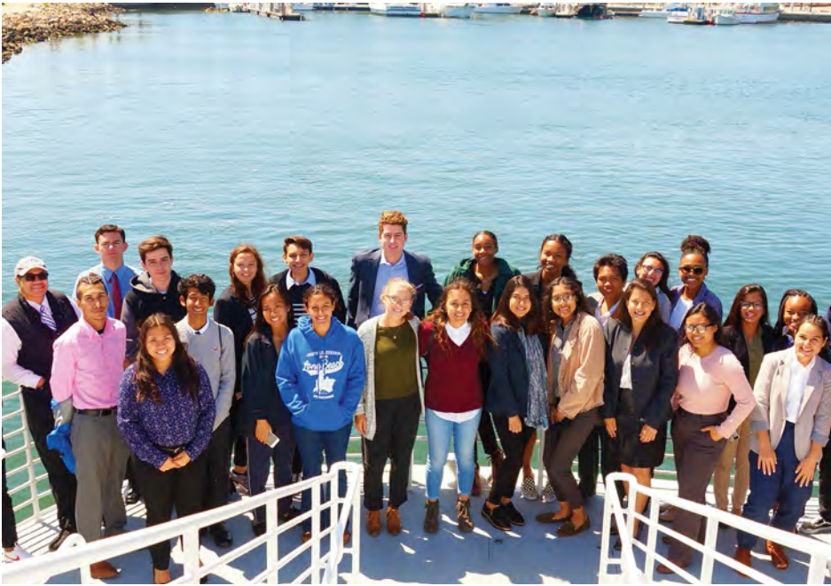
Touring the Port of Long Beach provides great exposure and education to the YLLB students as they get an up close and personal view of the nation's second busiest port and learn and see the direct impact it can have on Southern California and the nation.

These various lessons have given students insight into an assortment of career pathways. The events of the program are versatile and touch upon the fields of law, engineering, political science, journalism, environmentalism and human re-