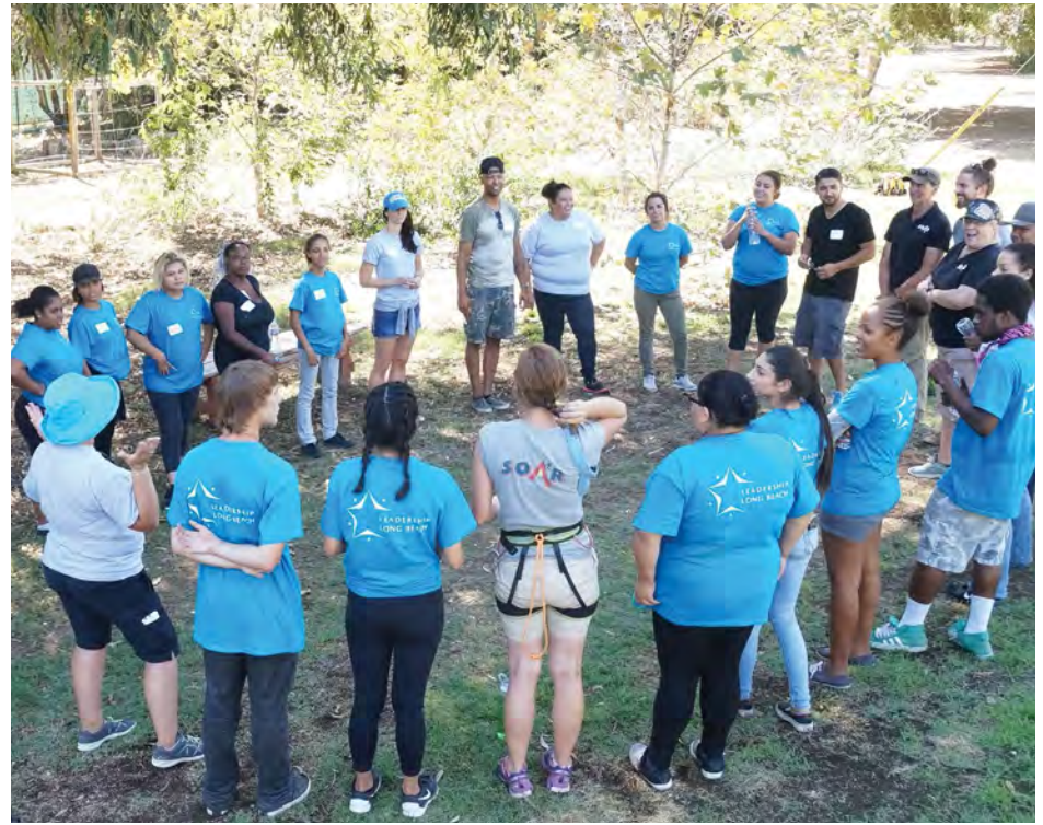
Small and large group activities are integral components of the Leadership Foundations program. They are used to improve group dynamics and team communication.

The Foundations program utilizes a retreat experience to create a more dynamic learning environment than the usual classroom setting. LLB is able to keep the program local in Long Beach by using CampFire USA – Long Beach facilities in East Long Beach, contributing to the spirit of using local resources. ■