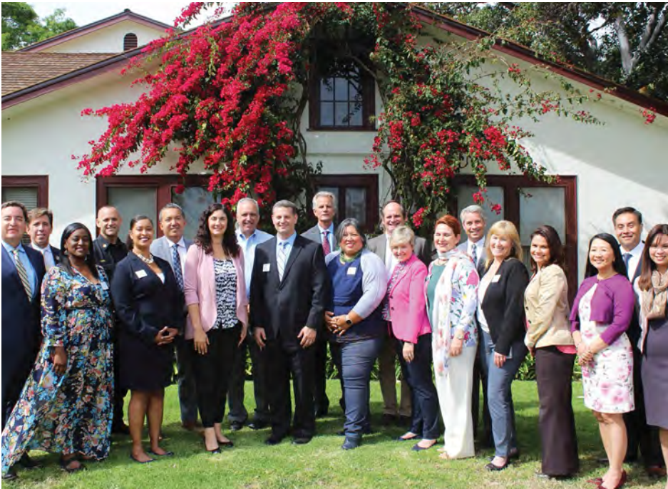
The 2019 ELS Class has 20 executive participants ranging from the corporate, nonprofit and public sectors; the ELS program has been growing steadily since 2015.