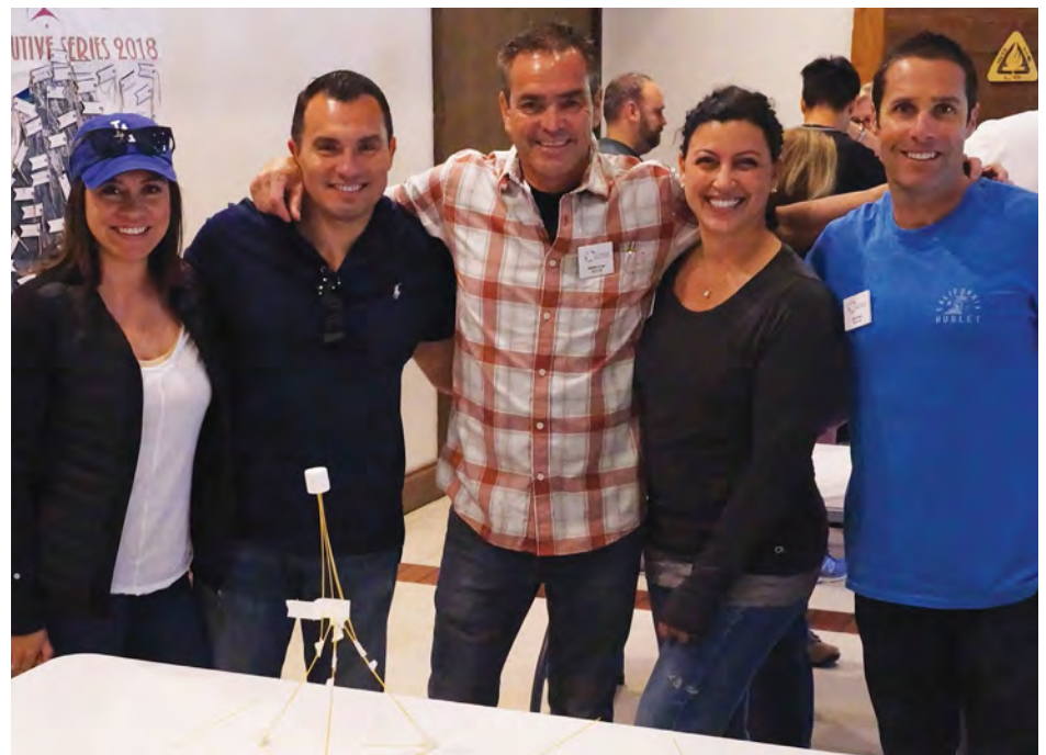
With all activities, accomplishments made by the group and individuals are highlighted toward the overall success.