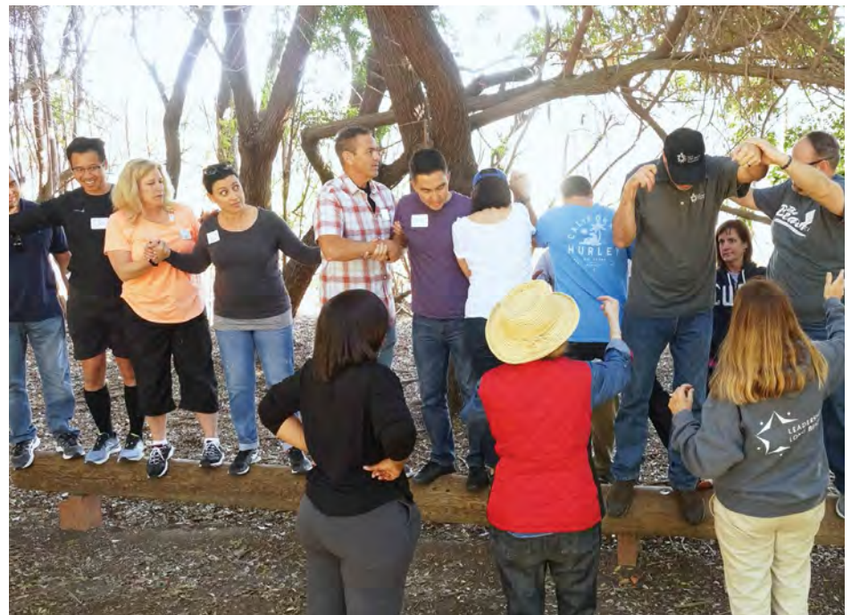
Challenging activities, both physical and mental, engage Foundation participants to work together throughout the program sessions.